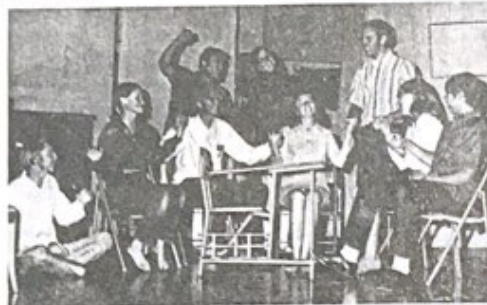
Shown here are the seniors hard at work to make the senior play a big success.

Snob Day was held Wednesday. On that day the girls could not speak to the boys between classes. If they did so, they had to pay the boys $6 each time.