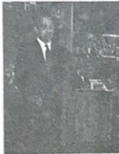
Senator Alquist and State assemblyman Milias shown working and relaxing, during their visit to Leigh High.