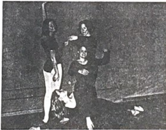
Modern dance students don tights and leotards to display their talents.

To give all students an equal chance the State Colleges recommend mid-year high school graduates seek admission to junior college, lower division students now enrolled in junior college should not transfer, those contemplating part time enrollment as unclassified students should consider extension courses, all applicants should consider means by which they might be able to accept redirection to another state college, and any applicant not yet accepted by a state college should make alternate plans.