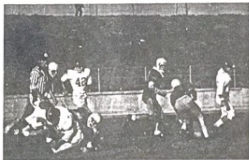
An unidentified Leigh runner is brought down by a Camden defenstevman as various players look on. The Little Longhorns remained undefeated as they beat the Cougars 20-0.

The Region II meet was held November 21.