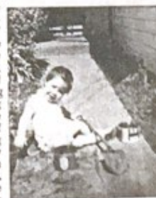
Gee--you sure look familiar. Haven't you been here once already today?

Another incident took place during a softball game in which she was pitching. A wild pitch hit and knocked out the batter, which in this case happened to