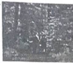
Autumn in black and white doesn't do justice to the season; color the leaves brown and gold.